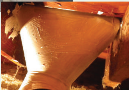
Right: Scraped and encapsulated boot (part of HVAC system).