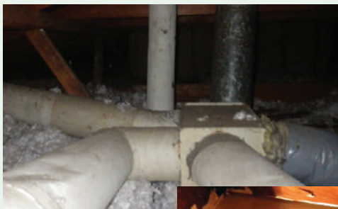
Top: Typical asbestos insulated ducting.

While every project has its own unique qualities, the steps outlined inside provide a basic understanding of ERI's abatement process.